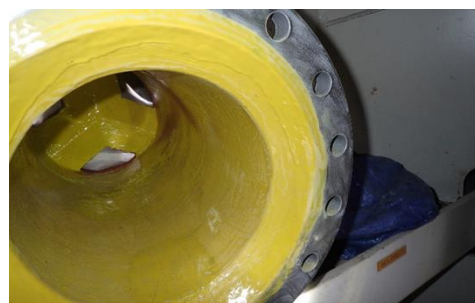
Application of first layer coatings completed