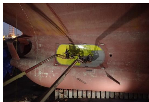
Application of first layer of Wencon coating is in progress